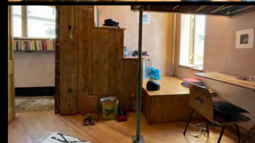
BACK 2ND FLOOR BED/R(11)