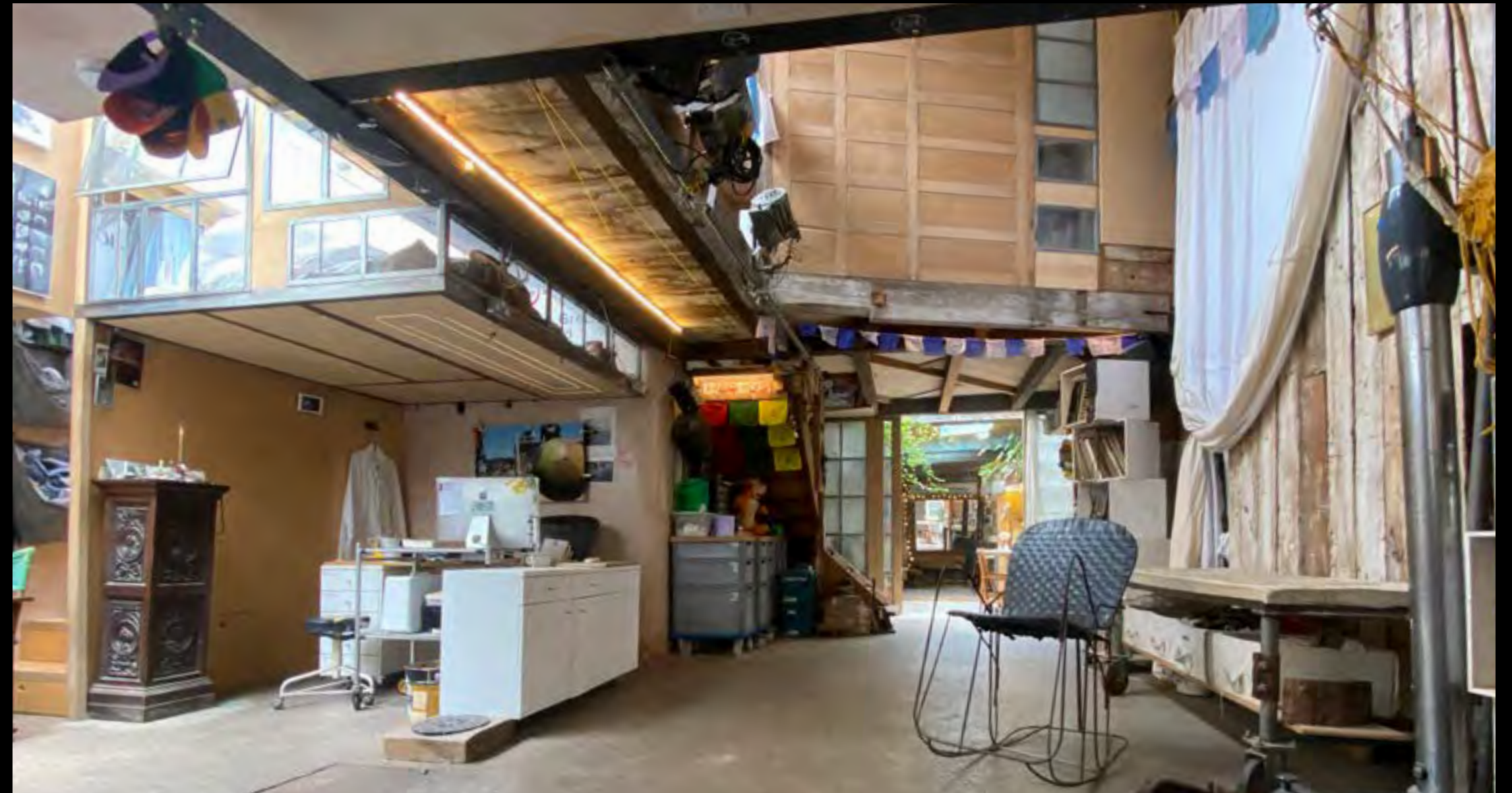
STUDIO VIEW OF MEZZA BEDROOM (1)