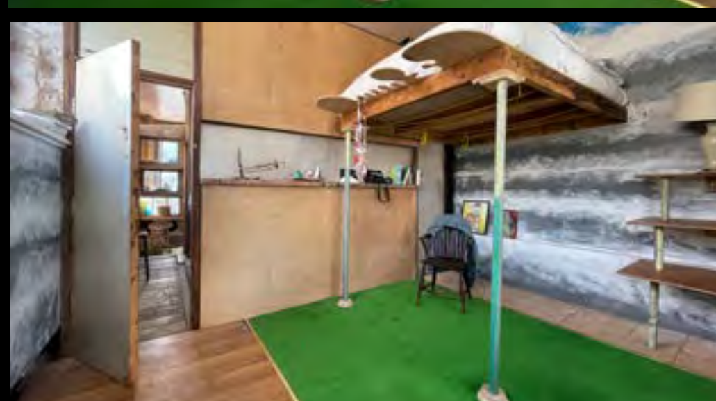
FRONT 2ND FLOOR BED/R(9)