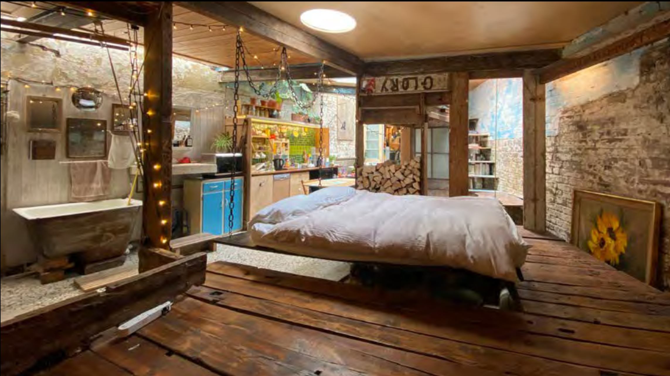
BACK VIEW INC. 2ND BATH/R, MASTER BEDROOM + BABY MEZZA (6)