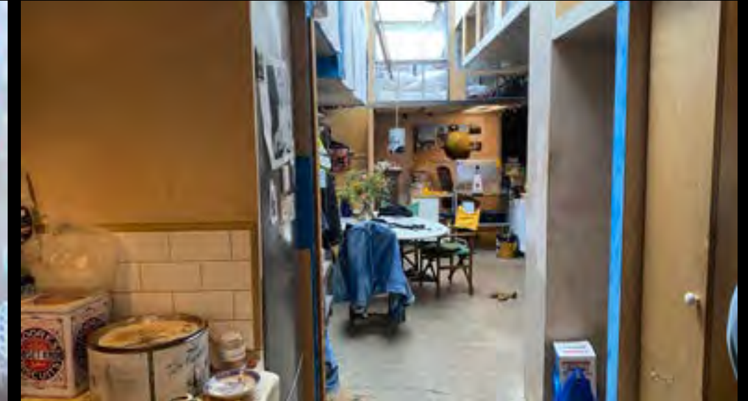
FRONT KITCHEN INTO STUDIO