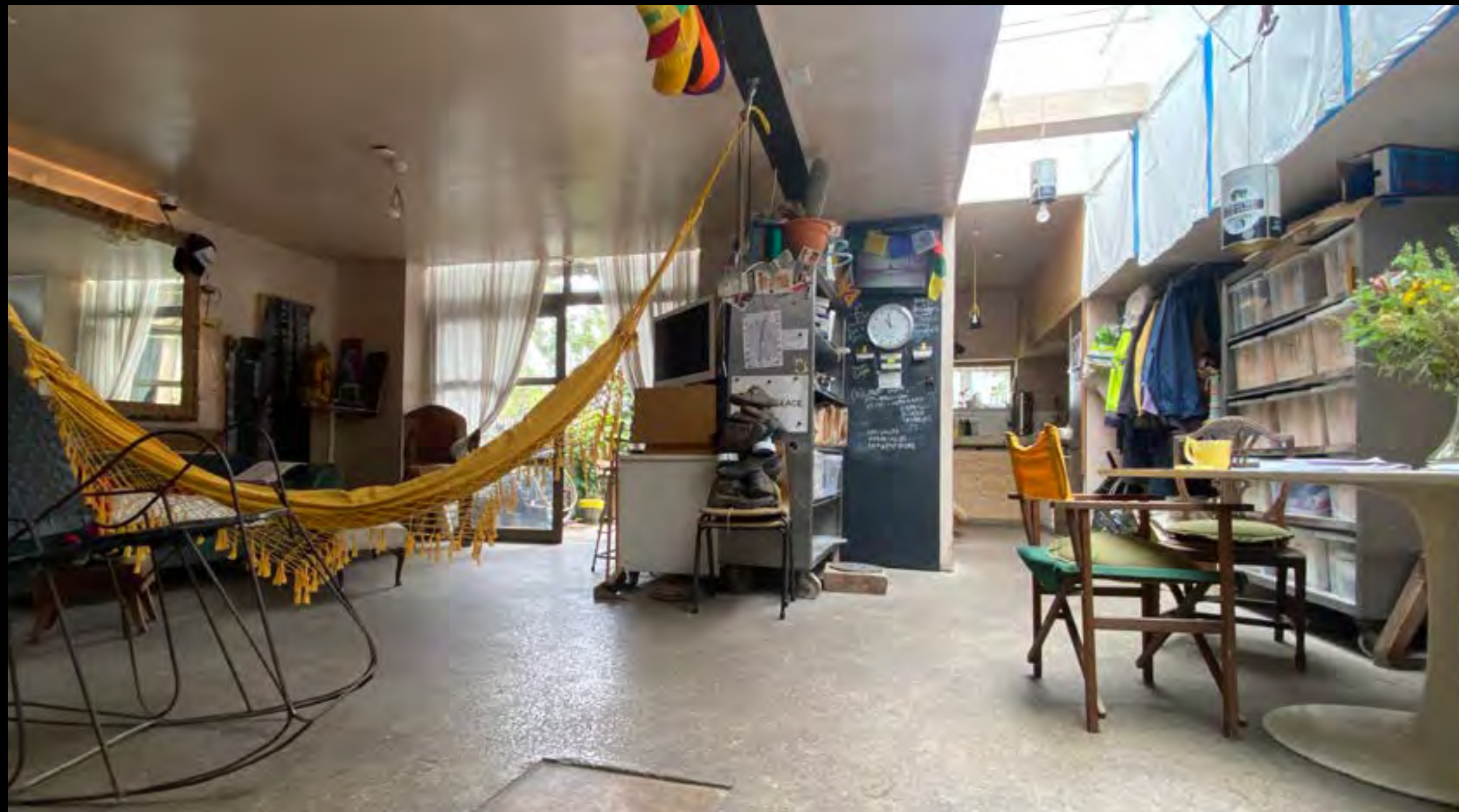
STUDIO VIEW OF KITCHEN AND FRONT (2)