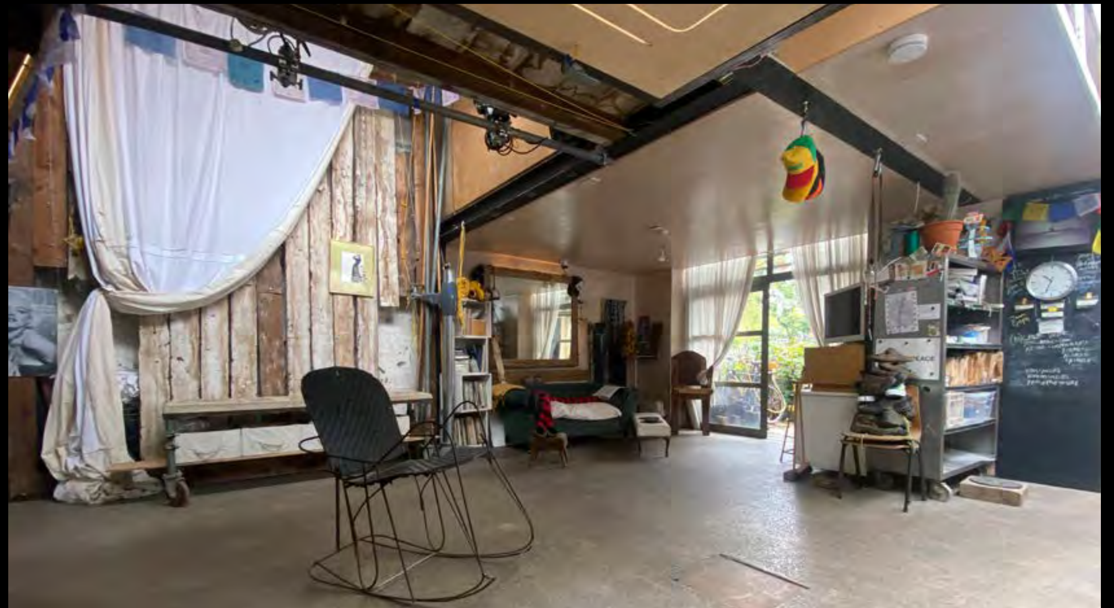
STUDIO VIEW OF FRONT AND DOUBLE HEIGHT LIGHT WELL (3)