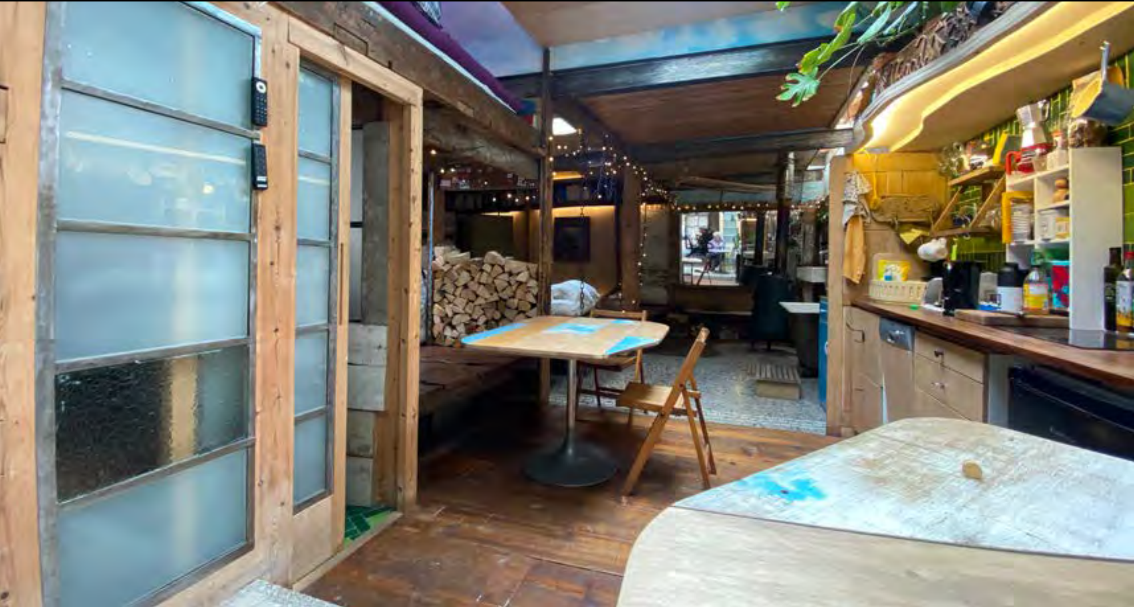
BACK VIEW INC. 2ND LOO AND 2ND KITCHEN (4)