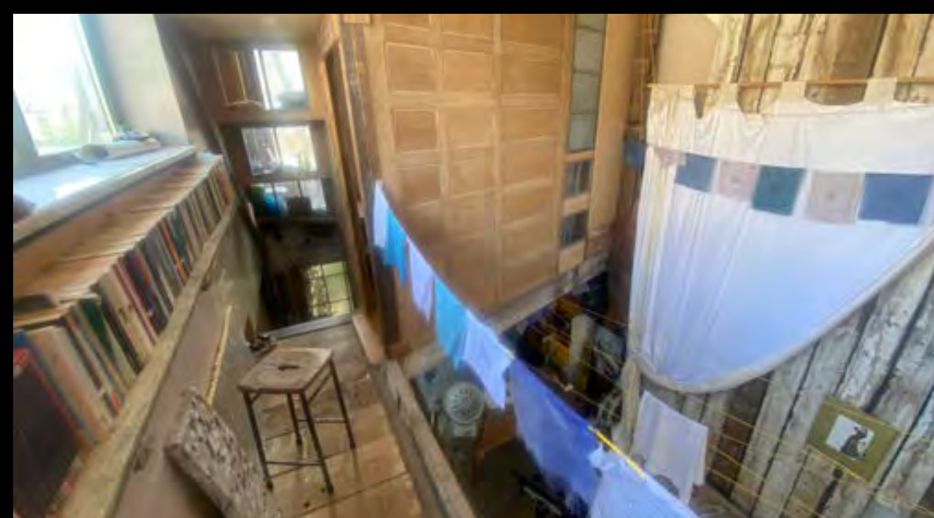
DOUBLE HEIGHT LIGHT WELL(10)